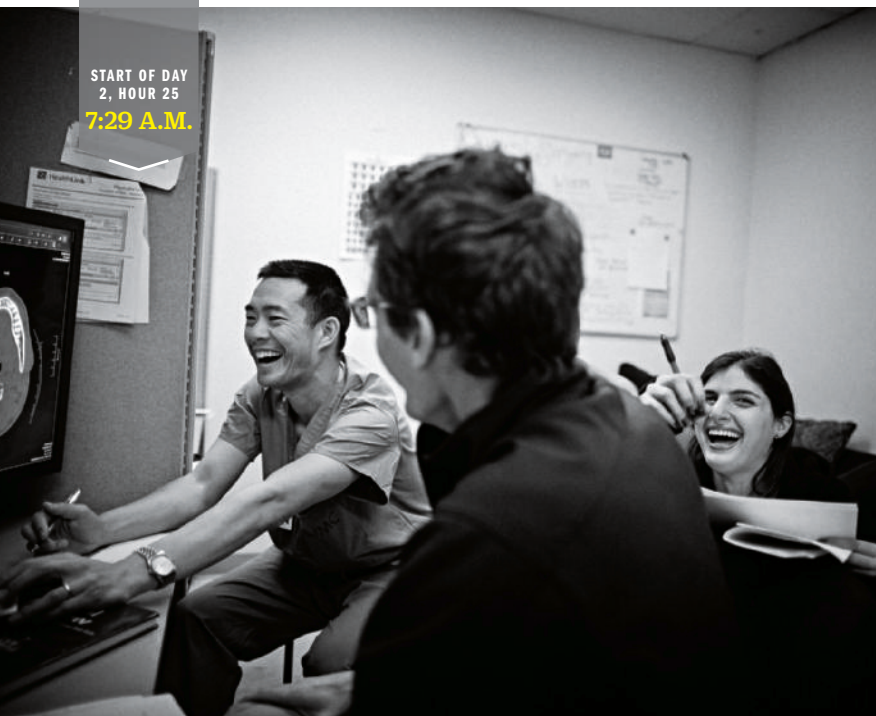
START OF DAY 2, HOUR 25 7:29 A.M.